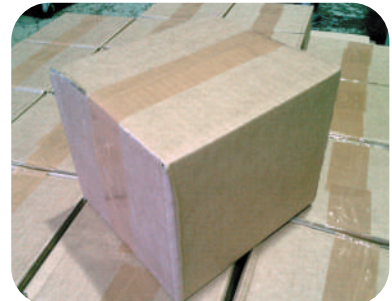
1.200 rolls in pallet